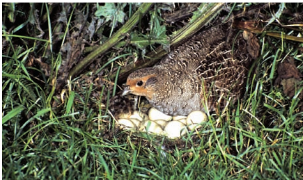
FIG 7. Grey Partridge Perdix perdix , a once-common resident in much of Britain and Ireland, now much declined. Most individuals disperse to breed less than one kilometre from where they were hatched. (Bobby Smith)

At the opposite end of the spectrum from migratory populations are sedentary (or resident) ones. A sedentary bird population can be defined as one whose distribution remains more or less the same year-round, and from year to year. Individuals of sedentary populations typically show no directional bias in their movements at any time of year (unless imposed by local topography), and generally move over much shorter distances than migrants. In the British Isles, as elsewhere, individuals of many resident bird species have been ringed in large numbers as chicks or adults, and the subsequent recoveries have given some idea of the overall movement patterns. Typically, most birds of non-migratory species were found (up to several years later) near where they were ringed, in all directions, but with progressively fewer at increasing distances. In many populations which are resident within the British Isles, the median distance moved between ringing and recovery sites was less than 1 km, but some individuals had reached more than 20 km. This pattern held for some passerine