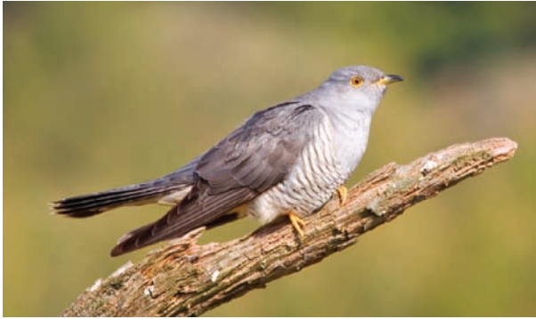
FIG 1. Cuckoo Cuculus canorus , a summer visitor to the British Isles which spends the winter in tropical Africa.

also to the same wintering places. Outside the tropics, their movements are most marked in spring and autumn, but can occur in every month of the year in one species or another. These facts raise questions about the ecological factors that underlie the movements and distributions of birds that simply do not arise with more sedentary organisms.