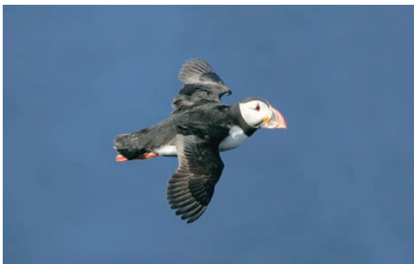
FIG 3. Puffin Fratercula arctica , which nests on offshore islands around the British Isles, and winters widely over the West Atlantic, usually far from land. (Edmund Fellowes)

non-breeders of such species are not locality-tied in the same way as breeders, and are free to feed away from nesting areas throughout the year. It is not unusual in these species for adults and immatures to concentrate in different regions in the breeding season, and in some such species the young remain in 'winter quarters' year-round, returning to nesting areas only when they are approaching breeding age. This holds for many kinds of seabirds, waders, large raptors and others (Chapters 9 and 21).