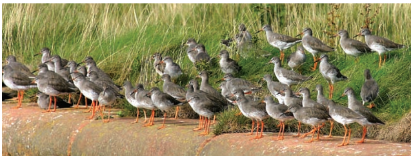
FIG 2. Common Redshanks Tringa totanus , whose wintering population consists of local breeders and winter visitors mainly from Iceland.

periods of torpidity, usually lasting a few hours at a time. So it seems that the need for torpor was not necessarily a total stumbling block to birds developing hibernation. We can only surmise that the supreme adaptations of birds for long-distance flight and efficient energy use have tipped the balance in favour of migration over hibernation in the majority of species.