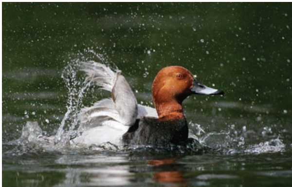
FIG 4. Pochard Aythya ferina (drake), a scarce breeder but common winter visitor to the British Isles, coming from as far east as central Siberia.

Many other seabird species disperse eastward or westward after breeding to spend the winter away from their nesting colonies, concentrating at upwellings and other areas of abundant food, but remaining within the same oceanic zones year-round. Examples include the Northern Fulmar and Black-legged Kittiwake in the northern hemisphere, and various albatrosses and petrels in the southern hemisphere. At high southern latitudes, the Southern Ocean extends continuously around the earth, uninterrupted by continents. This allows some seabird species to circle the earth in their non-breeding periods, assisted by